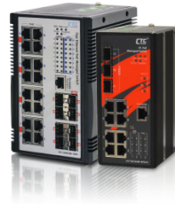
Industrial Managed FE PoE Switches IFS-1608GSM-16PH & IFS+803GSM-8PH24