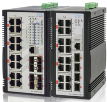
Industrial Managed GbE PoE Switches IGS-1608SM-16PH & IGS-1604XSM-16PH