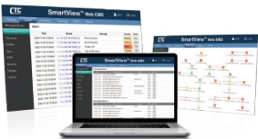
SmartView™ WEB EMS Element Management System

• The specification and pictures are subject to change without notice.