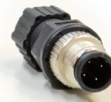
For FE UTP