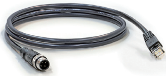
For FE UTP

M12 D-code Male (4-Pin) to RJ-45, AWG 24, IP67, 1 meter