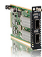
FRM220-100GE-2Q 100G Transponder Card