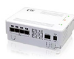
QSW-4204M 4x 1G/2.5G RJ45 + 2x 10G SFP+ slots