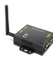
STE211W 2-port Serial to Ethernet Device Server