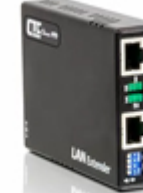
LX100 10/100 Base-TX LAN Extender