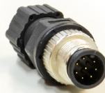
For GbE UTP (A-code model)