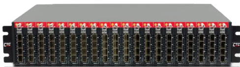
2U 19" 20-slot Rackmount Chassis