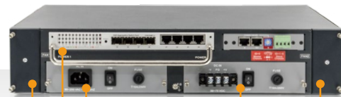
Cooling Fan, Redundant Power, Cooling Fan, 10G/1G Ethernet Aggregation Switch Card